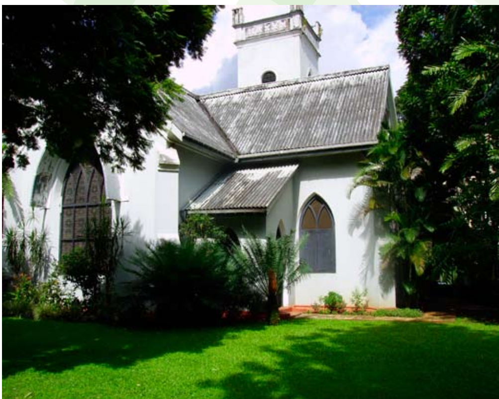
The Scot's Kirk, Kandy