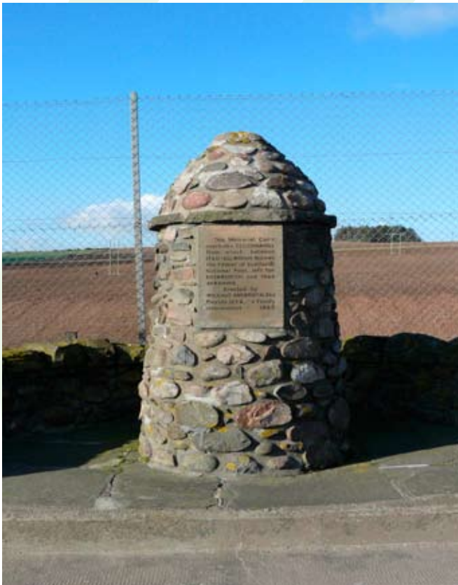
The Burnes Cairn on the A90