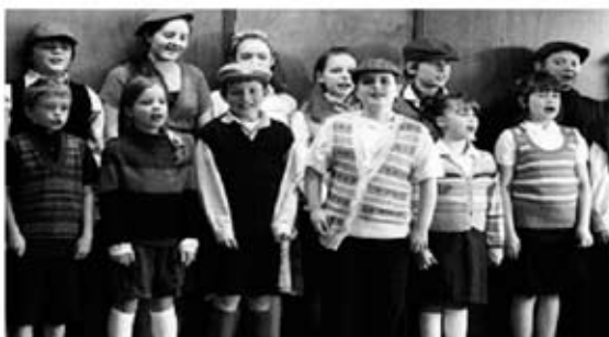
Crathes Primary School P4s - P7s entertaining the diners at the Friendship Lunch on 24th March.