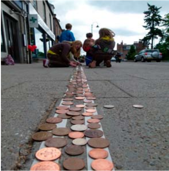
A High Street of Coins