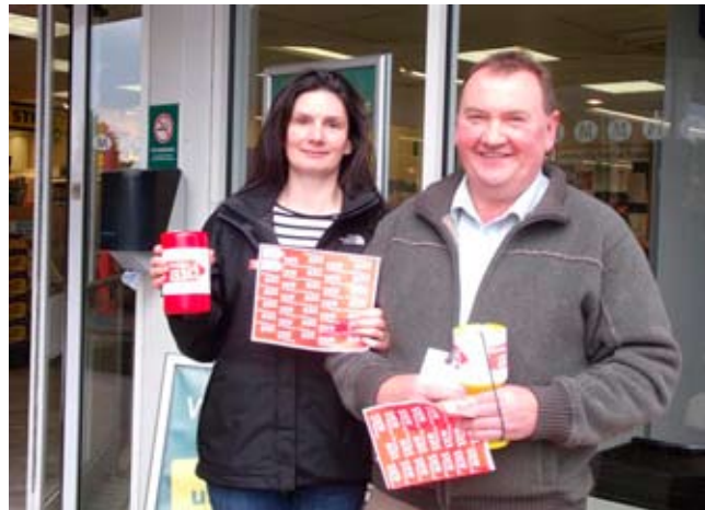
Collecting at Morrisons